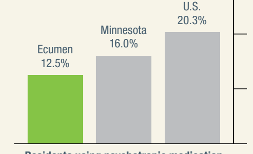
Residents using psychotropic medication (Source: Medicare.gov, 7/2013–3/2014)

According to Centers for Medicare and Medicaid rankings, Ecumen nursing home resident use of psychotropic medication ranks far below Minnesota and national rates. Minnesota Department of Human Services and Notre Dame University analyses also showed significant improvement in life quality indicators for Awakenings residents. Awakenings has also received the following honors: